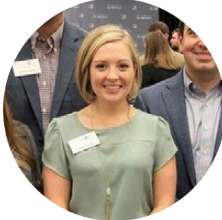
Earns Senior Accountant promotion in 2020