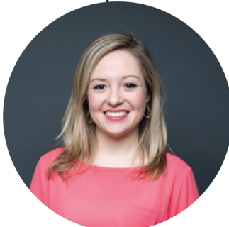
Starts full-time as a Staff Accountant at Kassouf and graduates from Master of Tax Accounting Program in August 2017