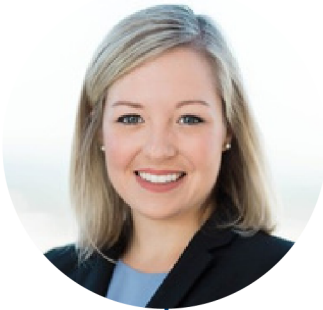
Earns Manager promotion in 2022