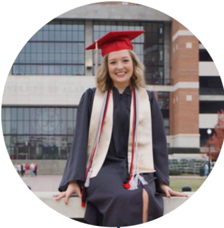
Graduates December 2015 with Bachelor of Science in Accounting