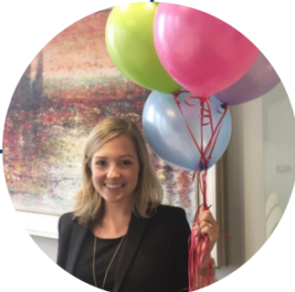
Passes Certified Public Accountant (CPA) Examination in September 2017