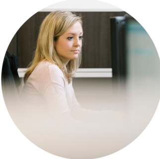
Interns at Kassouf in 2016